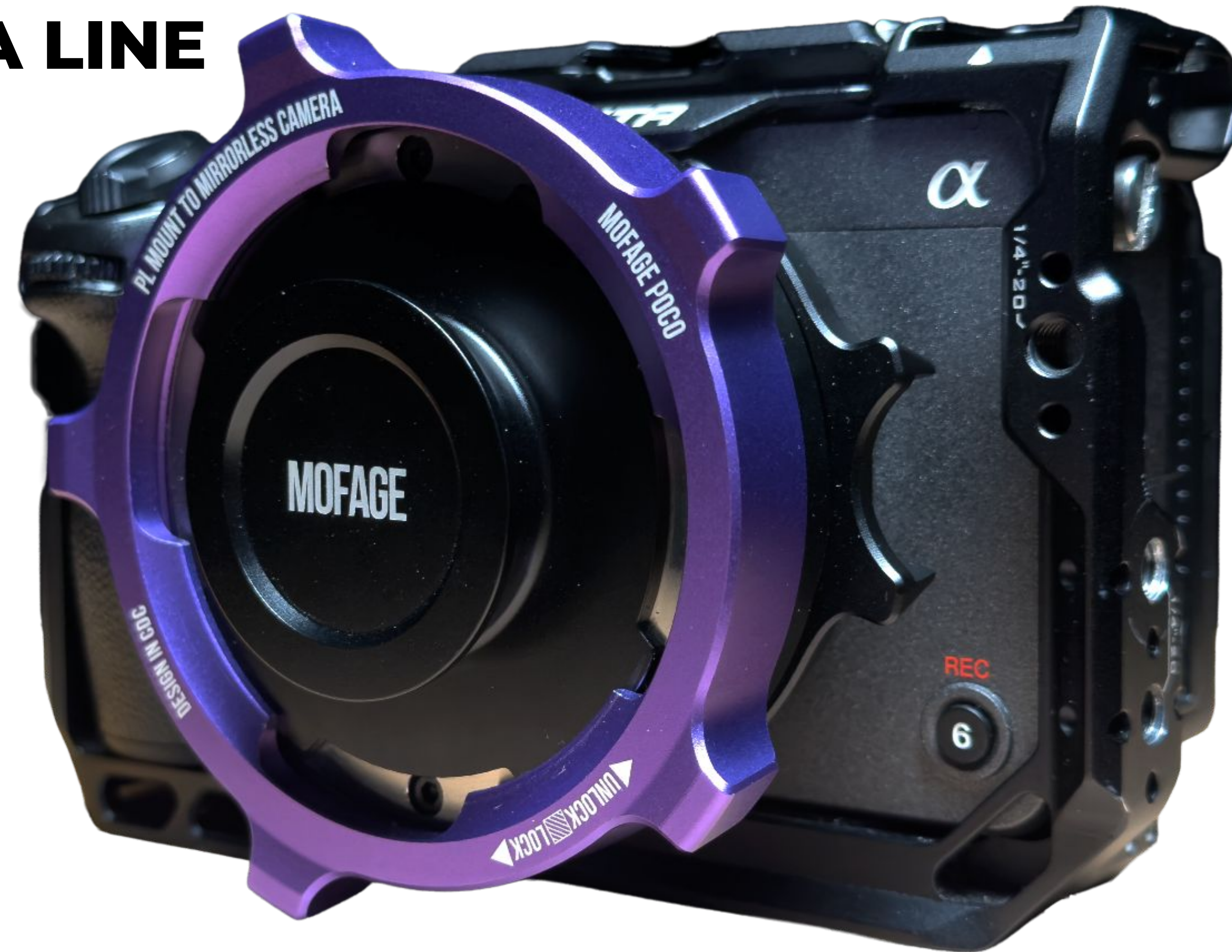
SONY FX3 CINEMA LINE 4K. 120p.