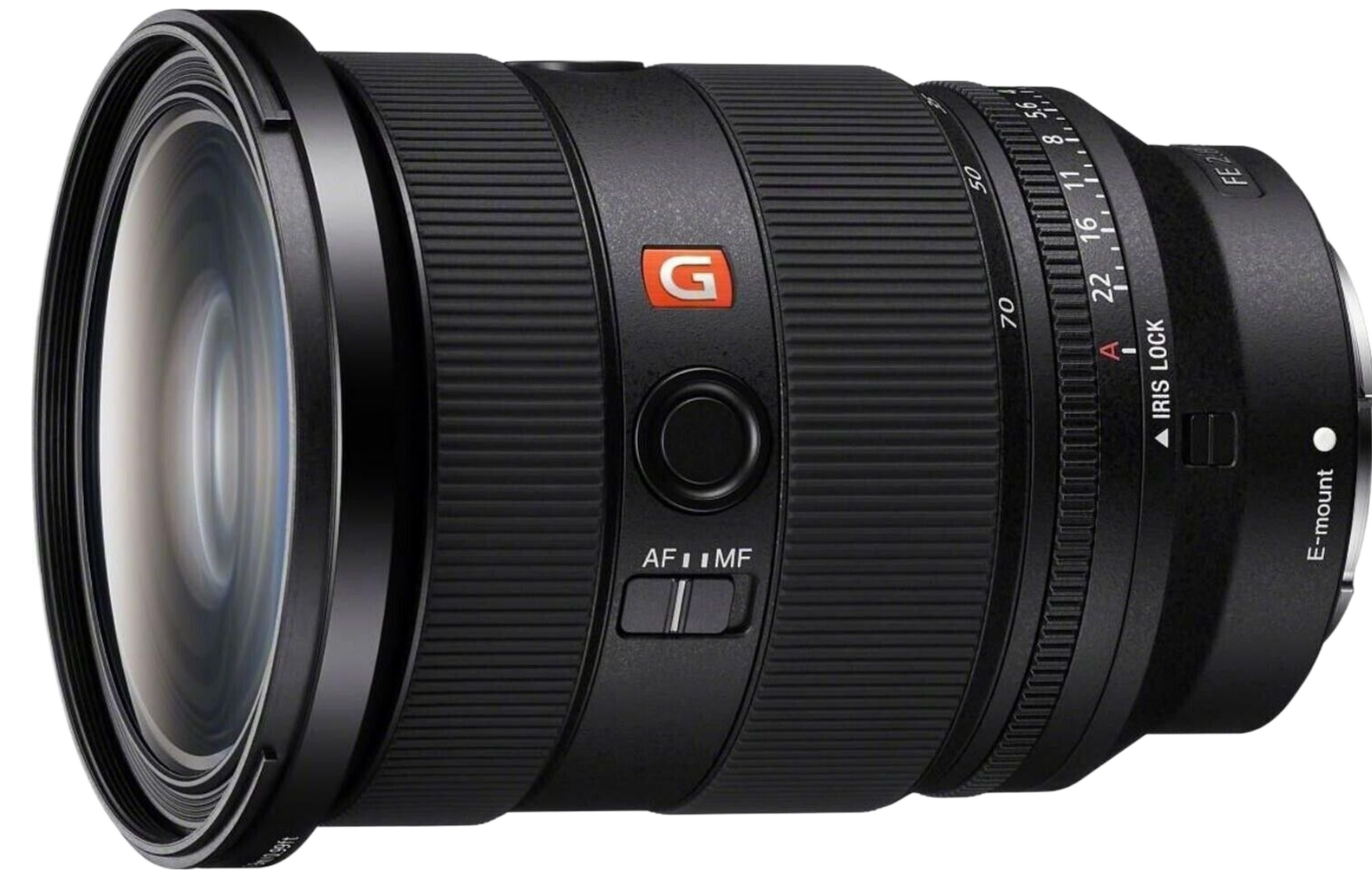
SONY FE 24-70mm F2.8